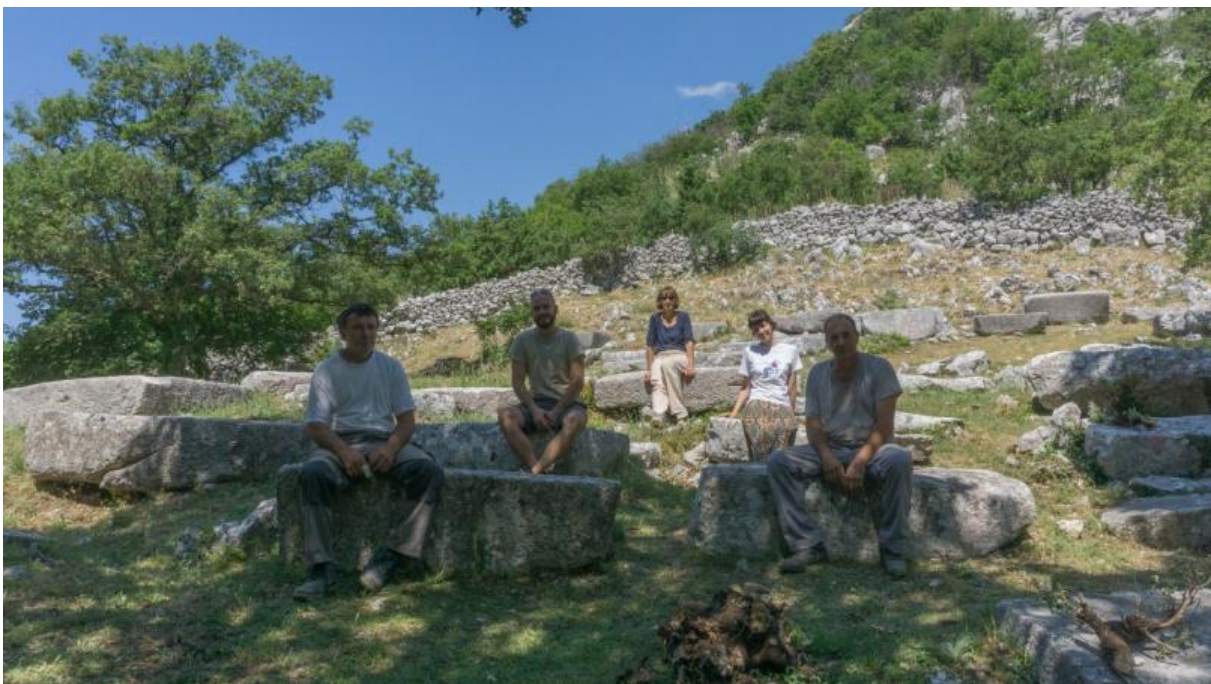
Photo: Dry stone artisans and volunteers taking a break after rebuilding a wall surrounding UNESCO protected medieval church with tombstones in Konavle, 2019